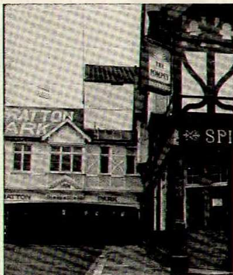
THE POMPEY HOTEL

It was decided there and then: this boy must come to Fratton Park. Negotiations are being conducted.